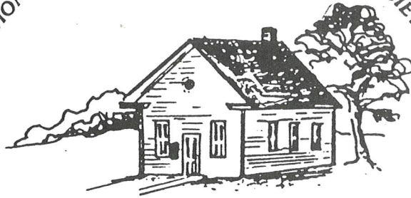
TOWN HALL-BUILT 1885