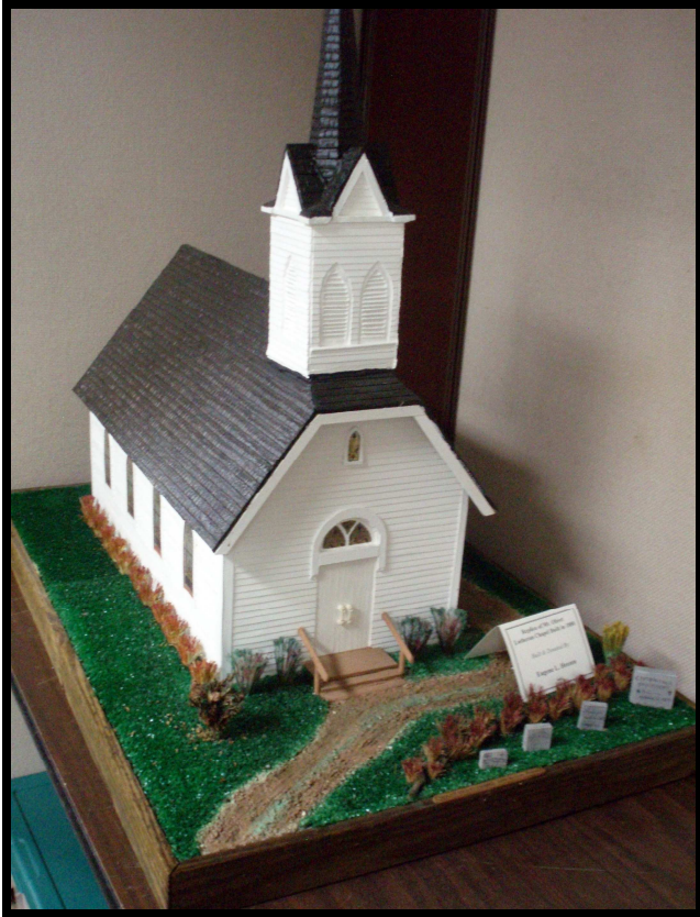
Mount Olivet Chapel

Over the past few years Gene Heezen has created and donated wonderful models of some of Plymouth's early buildings. They are a great asset to PHS which we use to illustrate living in early Plymouth. We are well on our way to completing our plan to have acrylic covers custom made for all the models. As of today we only have: St. Joseph's Church & Mt. Olivet Chapel left to complete. The cost is $360 for each custom church cover to complete our project. As a result we wanted to ask if any of our supporters of the Plymouth Historical Society would like to donate money to complete a cover for one or both of the models? If you do, contact any one of the PHS officers.