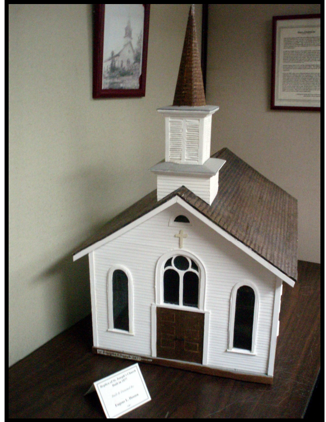
St. Joseph's Church