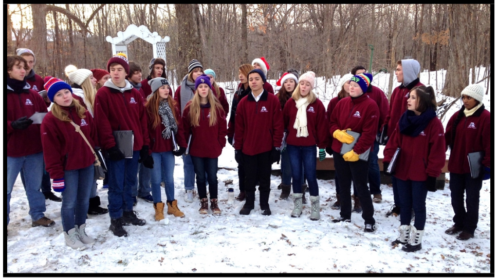
Armstrong Singers braving the cold.