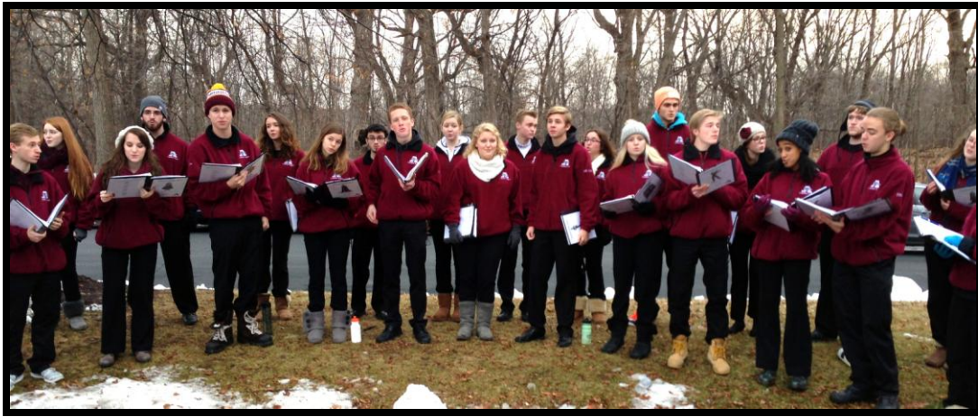
Armstrong Chamber Singers