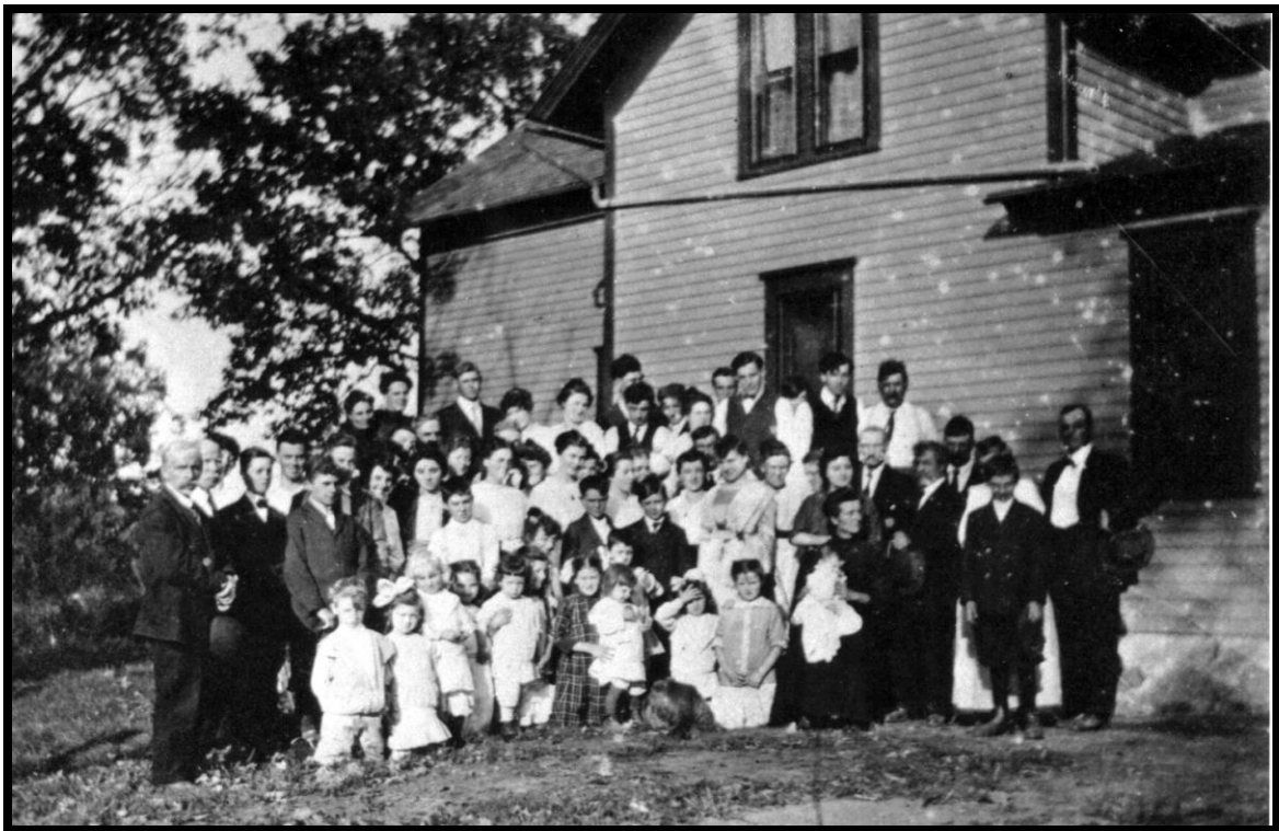
Guests at the Silver Anniversary Party