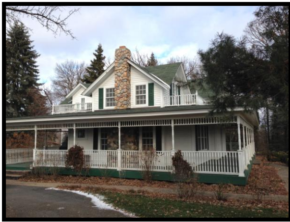
Today Restored – Original house ca 1889