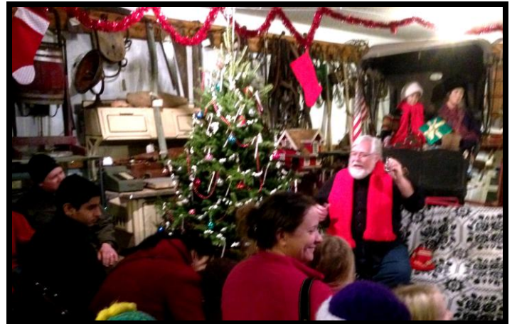
Oh the stories that were told