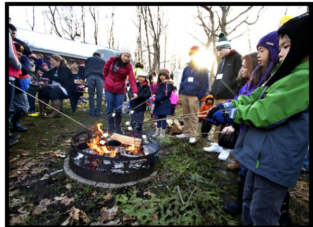
S'Mores taste so good