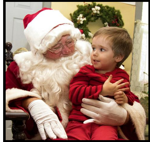
Oh my list is so long