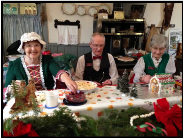
Santa's helpers making decorations