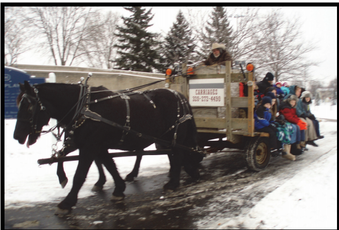
Daddy can we have another ride?