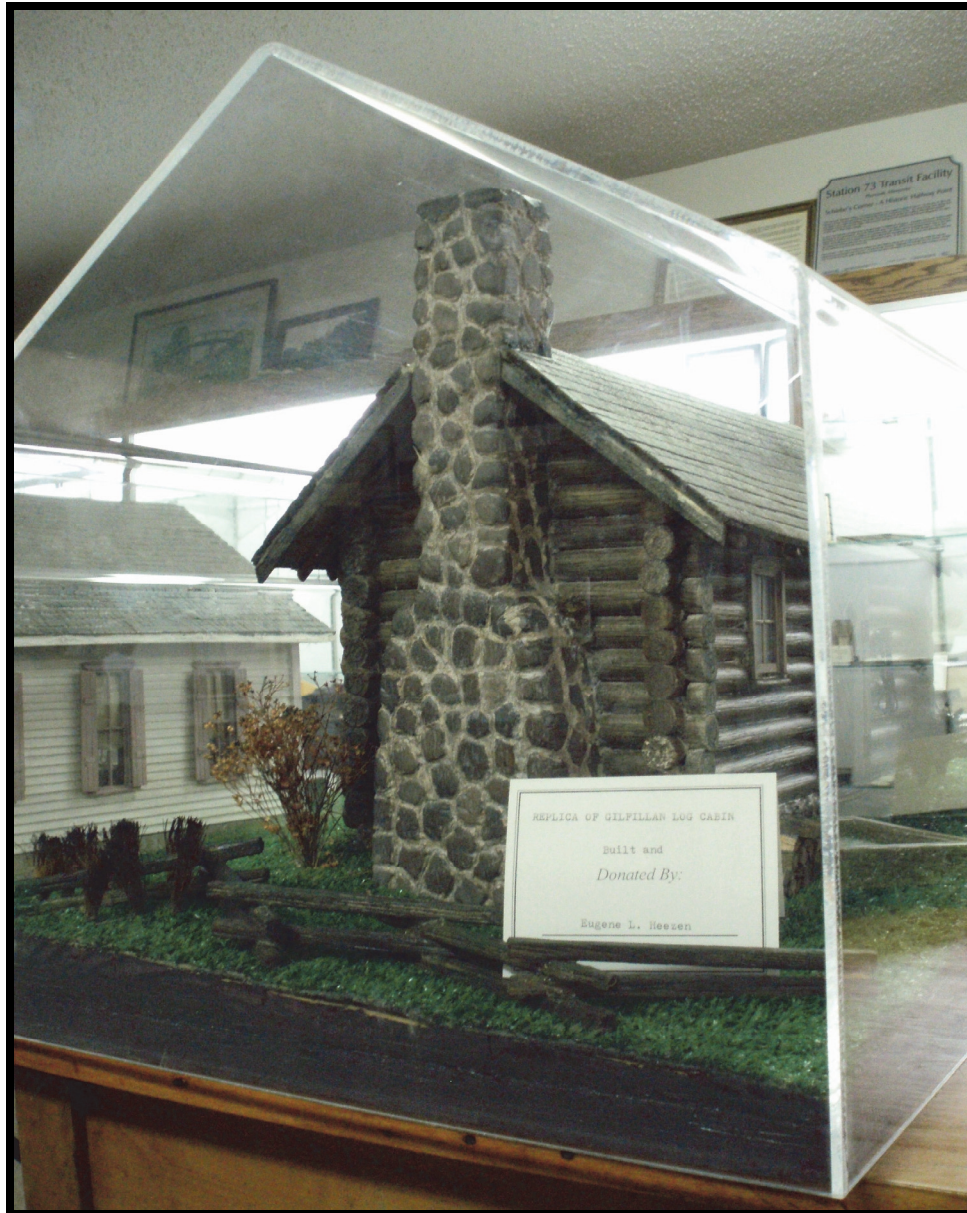
Example of acrylic cover

Over the past few years Gene Heezen has created and donated wonderful models of some of Plymouth's early buildings. They are a great asset to PHS which we use to illustrate living in early Plymouth. To ensure that the models are protected from little hands and dust so they will look as good many years from now as they do today we have a plan. It is to have acrylic covers custom made by Kreative Acrylics for all the models. As of today we have covers for five of our ten models and are looking to complete them for the following: St. Joseph's Church, Mt. Olivet Chapel, WigWam Inn, Ryan Farm House and Medicine Inn. The costs range from $260 to $360 for each custom cover to complete our project. As a result we wanted to ask if any of our supporters of the Plymouth Historical Society would like to donate money to complete a cover for one or all of the models? If you do contact any one of the PHS officers.