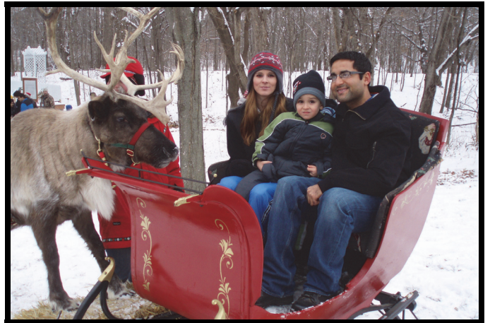
Is this Dancer or Prancer?