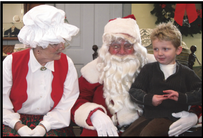
Santa I've been a good boy

On Sunday, December 4 th the Plymouth Historical Society and the Plymouth Park & Recreation held the 25 th Old Fashioned Christmas in Plymouth. It drew record crowds and the highlight was not only Santa Claus but his Reindeer. Great photo opportunities for the families. Here are a few photos of the wonderful day.