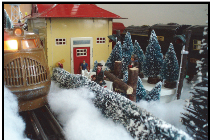
People were even arriving by train !