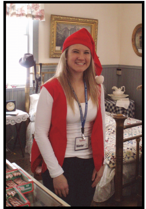
Elves – Y.E.S. Volunteers from Wayzata High School