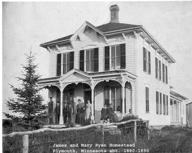
Picture of Ryan Farm House