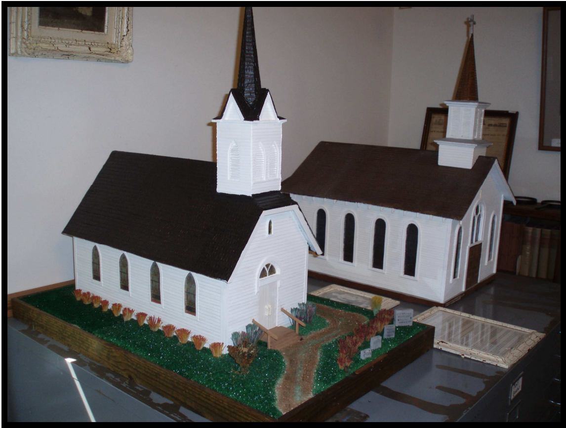
Old German and St. Joseph's Church