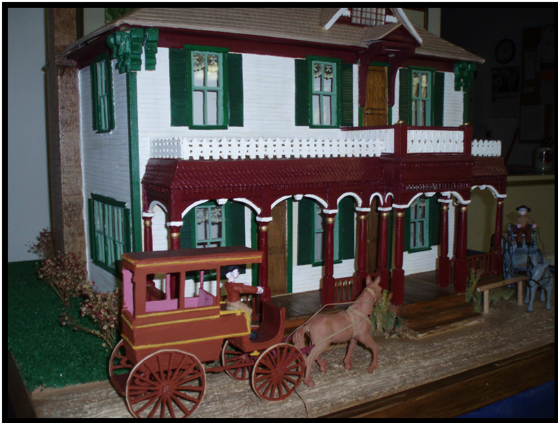
Model of Schiebe's Corner