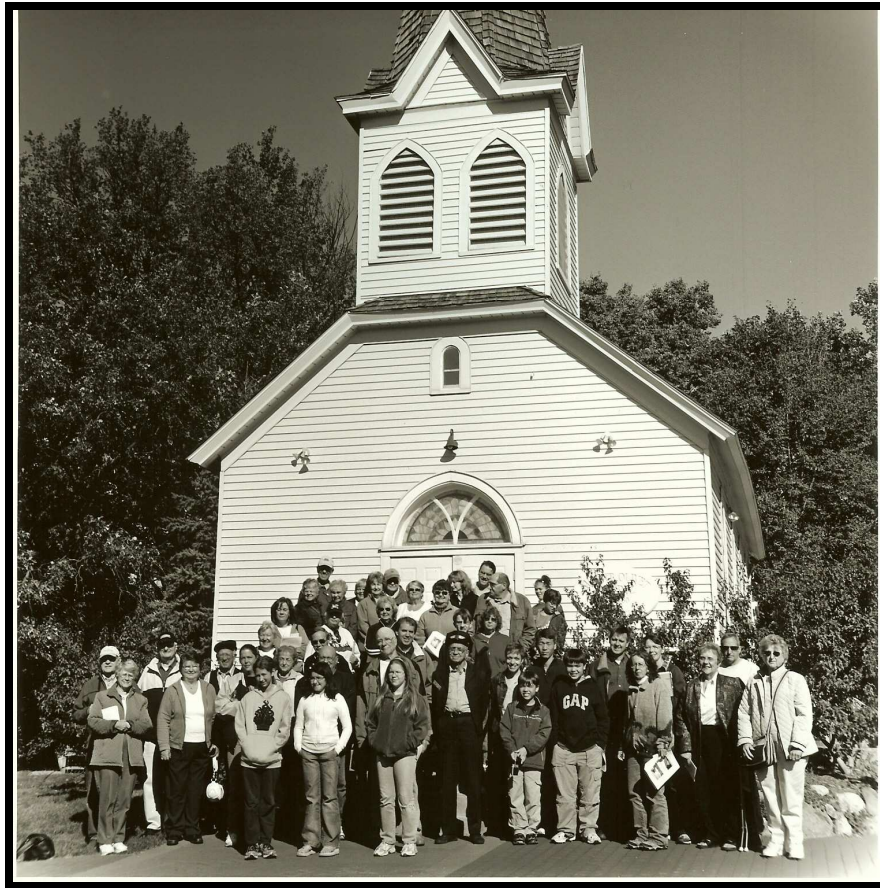
History on Tour at Mt. Olivet Chapel