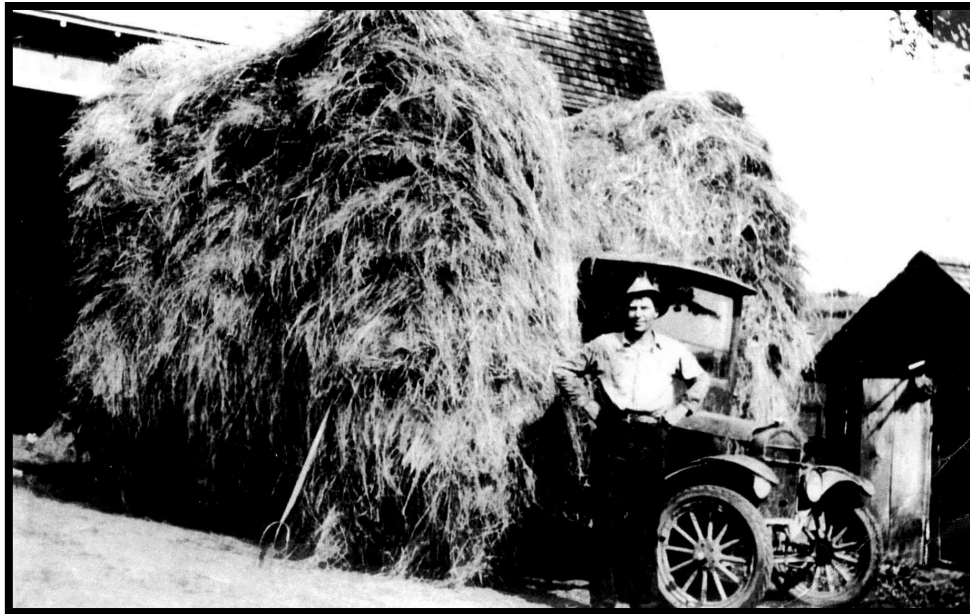
Fun Picture -Max Berthiame in 1930 with load of hay on Model T