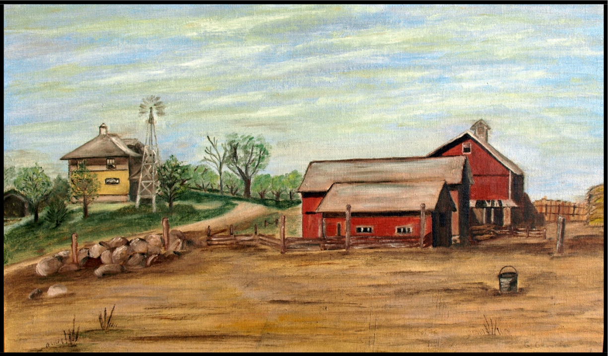
Painting by Gladys Grendall - 1971 reflecting what it would have looked like in 1930's County Road 13 (now Hwy 101) runs between house and barn