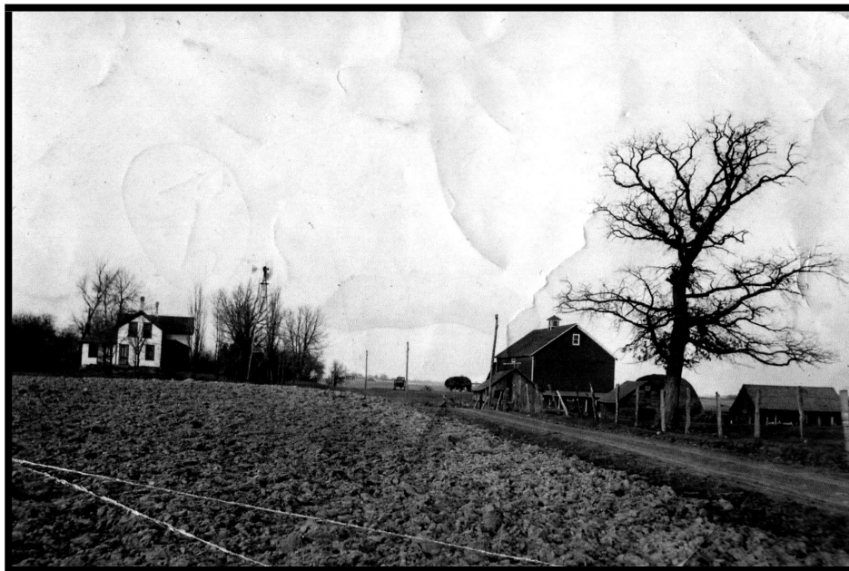
Circa 1900 to 1914 as the farm house burned in 1914 Today that is Hwy 101 heading north and picture taken approximately at Cty Rd 24 intersection.