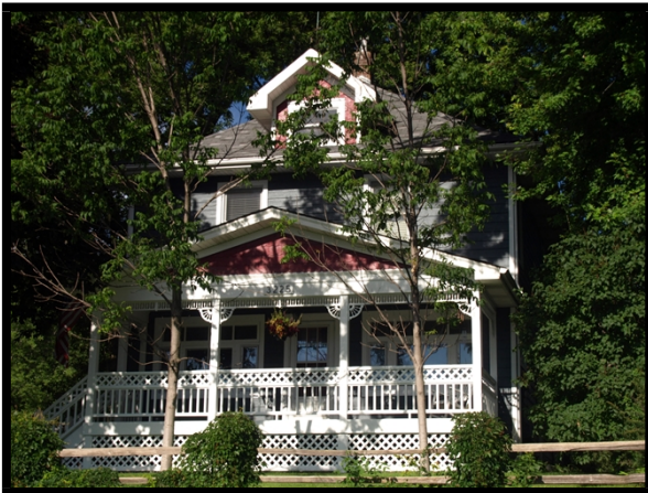
Front of house facing Hwy 101