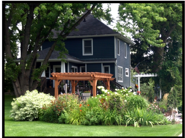
The back (now front) of house facing Queensland