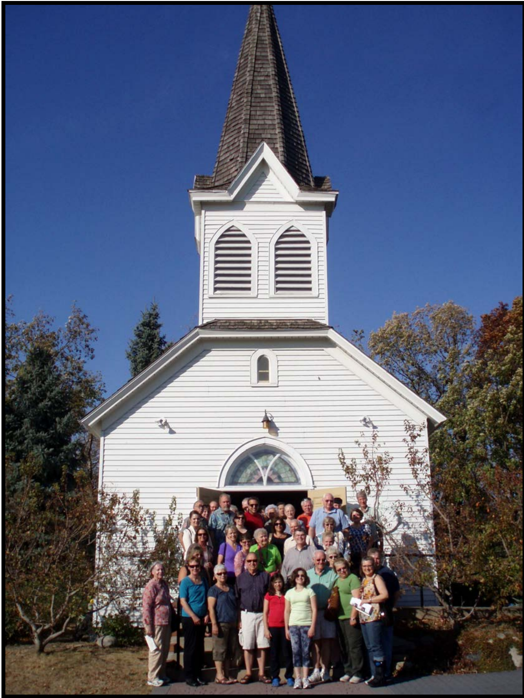
Tour Group Picture