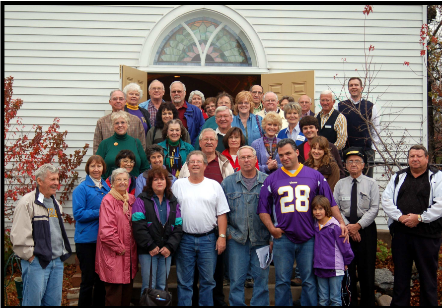
Tour Group Picture