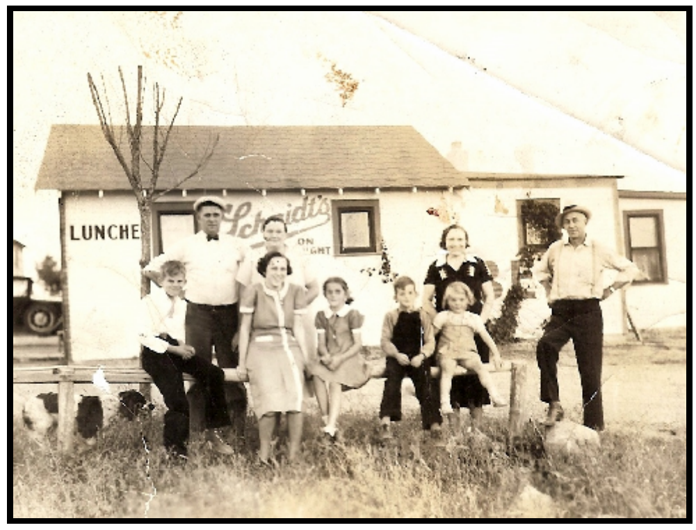
Pretzel Inn Circa 1940's Next to Turner's General Store