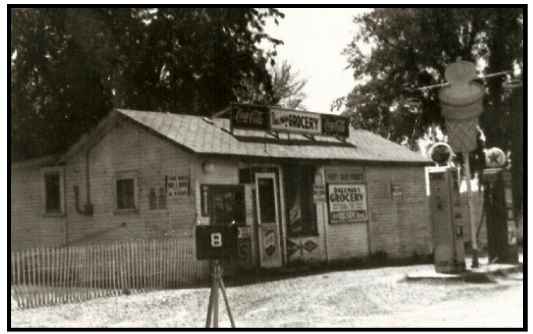
Turner's Store Located on SE corner of Fernbrook Lane and Rockford Road Photo taken by Plymouth's assessor in 1960's