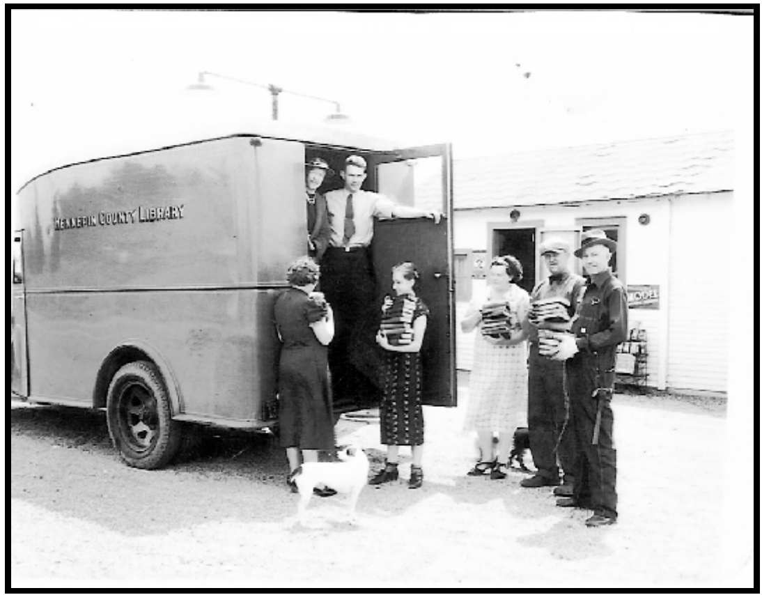
Bookmobile stop at Turner's Store 1937