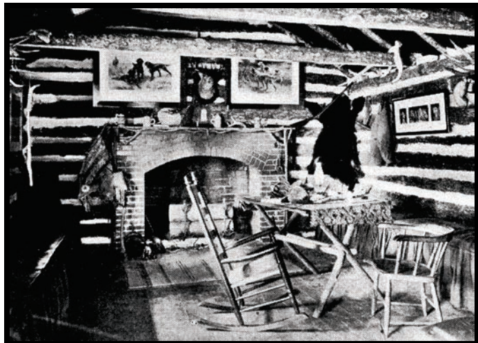
Inside of Cabin