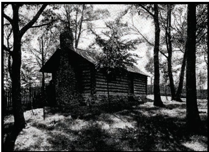
Log Cabin circa 1895 (Recreated in Parkers Lake Park)