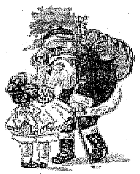
Best Thristone Wienes.